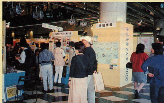
• A scene of last year's Fair

Contact address: Person in Charge, International Cooperation Fair (Fukuoka International Association), 1-10-1, Tenjin, Chuo-ku, Fukuoka, 810-0001. E-mail: fia@gol.com , Fax: 092-733-5635.