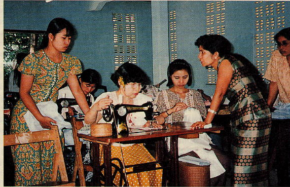
• Teaching sewing skills using a sewing machine

This international cooperation includes various people undertaking various activities including volunteers and specialists. Of course such positive action can be carried out not only overseas but domestically as well, and anyone can participate. Thanks to the mass-media, activities which are carried out overseas are attracting a lot of attention from people of all ages. Moreover, international cooperation and support activities carried out by NGOs tackling global problems are on the increase. Such projects differ from large scale ODA funded development projects in that most are carried out by grass-roots international cooperation volunteer groups. These NGO activities include a wide range of