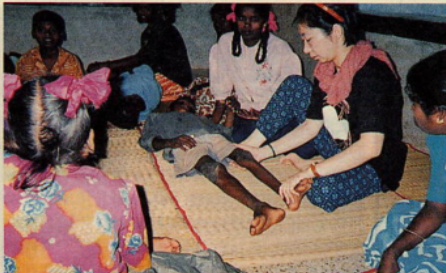
• Lessons in medical care by a volunteer

This summer I visited various NGO booths which were opened as part of the United Nations Conference on Global Warming which was held in Bonn, Germany. Meetings and negotiations regarding the Kyoto Protocol continued amongst Germany's abnormal weather which was a mixture of cold skin piercing drizzles and blistering sun. During this period, a boat resembling Noah's Ark was constructed from planks of wood on which were messages written by people from all over the world, and was carried from the square in which the statue of Beethoven stands to the United Nations Conference Center. Men and women, young and old joined the ever expanding, yet peaceful